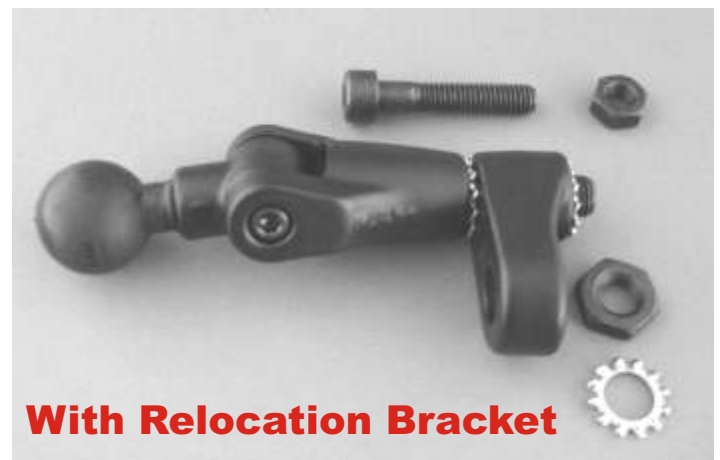
With Relocation Bracket

If you are planning to use the mirror relocation bracket to attach the mirror which was removed to expose the female threaded hole on your bike you will use bolt (G) or (H) depending on the thread pitch of the female threaded hole on your bike. You will need to attach the mirror to the mirror relocating bracket using either nut (I) or (J) depending on the thread pitch of your mirror. You will place (1 qty.) (M) star washer between the mirror and the mirror relocation bracket (C) and fully tighten.