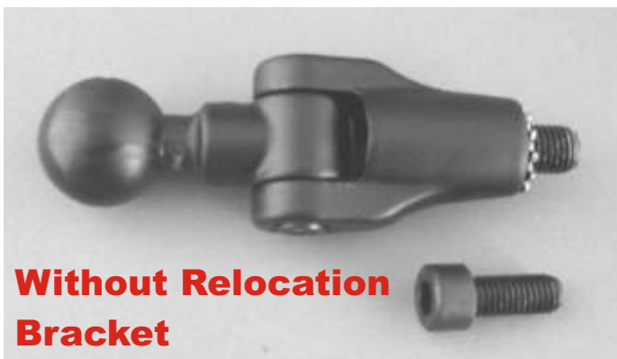
Without Relocation Bracket

If you chose not to use the mirror relocation bracket either bolt (K) or (L) will be used to attach the asseby to your bike.